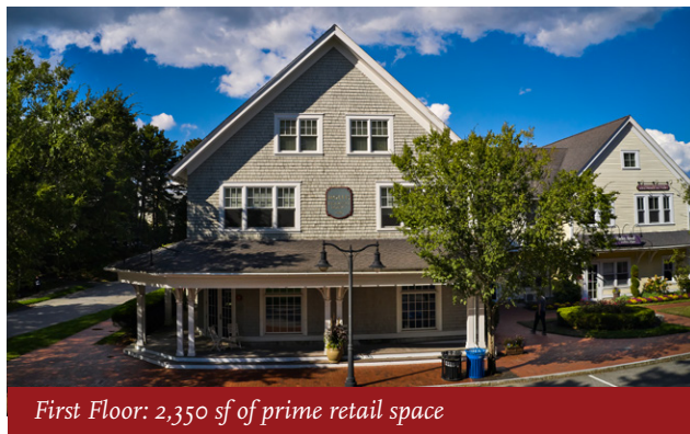
First Floor: 2,350 sf of prime retail space

Nestled among some of our most popular retail locations, this is in a prime location within The Village Green. With ample parking, tons of natural light and a welcoming covered porch, this space draws visitors in.